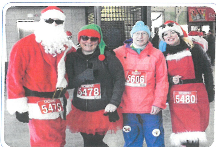
Some of our team-members participated in the Santa Shuffle Run in Ottawa and organized by the Salvation Army.