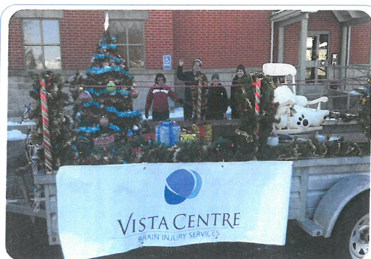
Our clients in Cornwall designed their own float to participate in the local Santa Claus Parade.

dental participants, as well as being a major contributor to the increase of participant satisfaction. VCBIS would like to thank families for their involvement and dedication towards the well-being of our clients, while recognizing that success rates are based essentially on relationships, together with services.