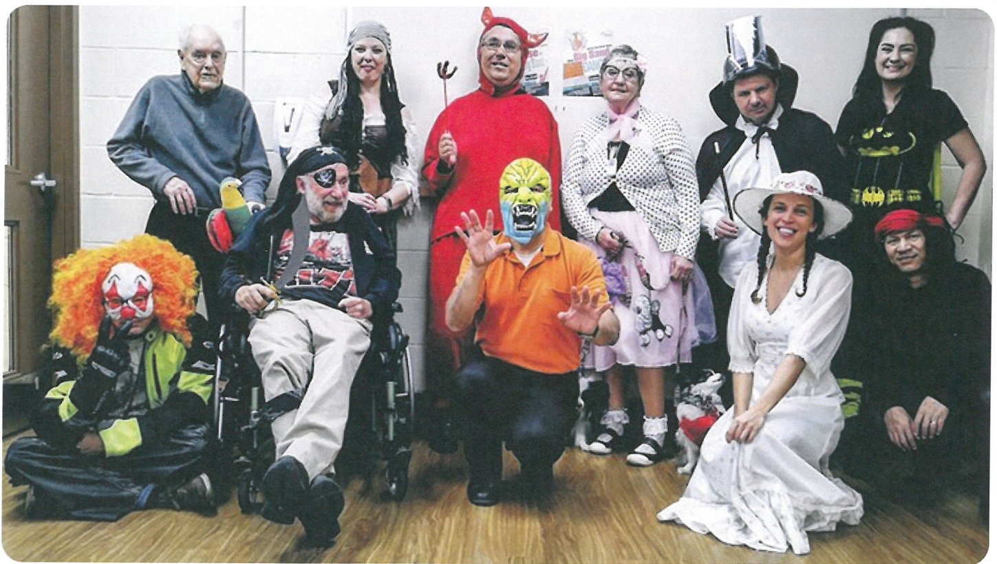
Our clients from the Day Program and staff in Ottawa designed their own costumes to celebrate Halloween.